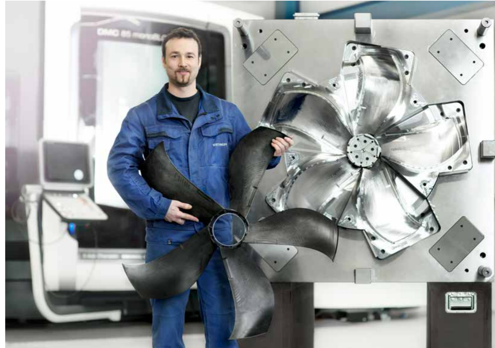
Forming Innovation 01 • 2017